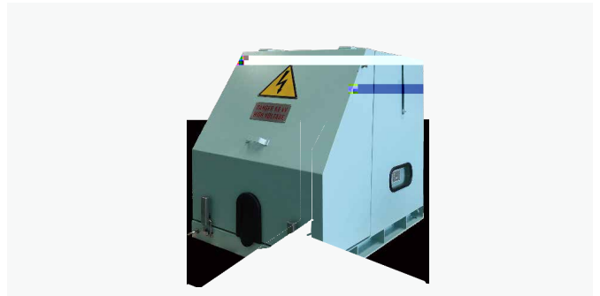
Special Dock Socket Box for Container Ship

The ship-shore connection subsystem mainly includes two parts: dock socket box and cable management system (required for some types of ship). The dock socket box is installed at the front of the dock, and the ship-shore electrical circuit is established by plugging in cables to shorten the connection time. The dock socket box maintenance door is provided with a travel switch and an interlock corresponding output switch to provide interlock protection for the maintenance work.