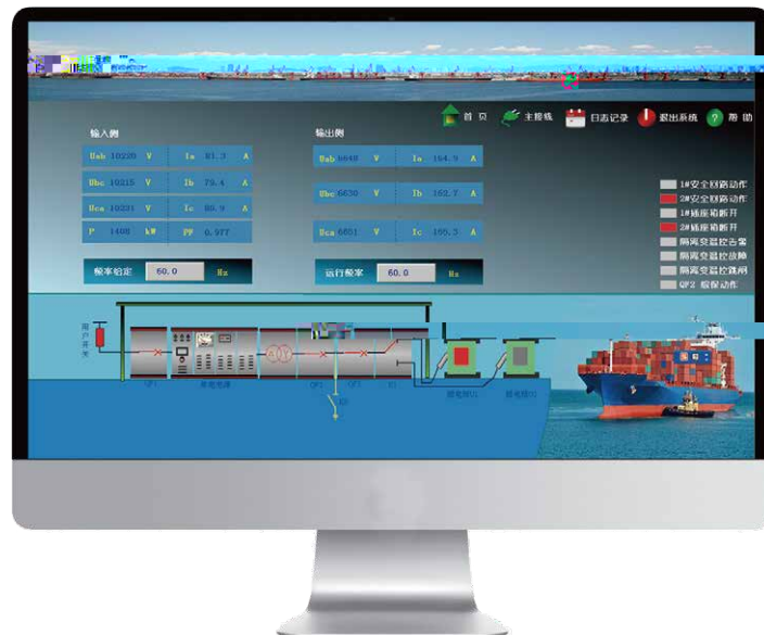
Shore Power Monitoring System

The data comprehensive monitoring subsystem not only monitors each device, but also communicates with the terminal monitoring system, which is convenient for the operator to grasp the operation status of the device. The monitoring system should record the output voltage and current data (including the necessary waveforms) during power supply, so that when the power supply is abnormally interrupted, the state of the fault can be traced back and the cause of the fault can be analyzed.